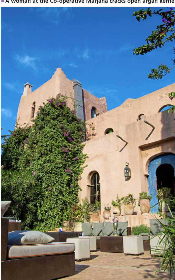
■The main building of Le Jardin des Douars, with the bar and